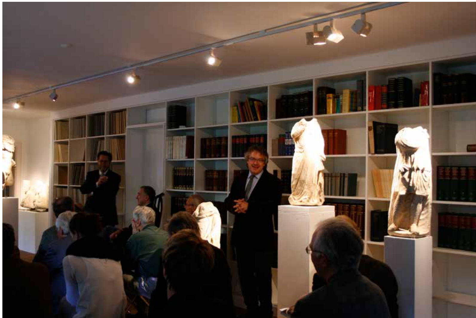
Bottom right: Exhibition at Nauenstrasse 71, Basle, 2010